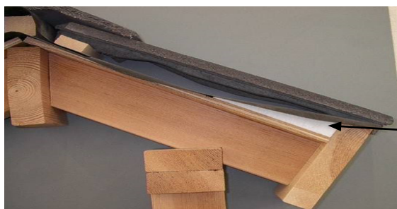
Anti-ponding material added for positive drainage

Shown below are a few of the various options we have seen used in the field to comply with this requirement. The anti-ponding material can be wood, metal or foam materials.